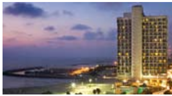
Renaissance Tel Aviv Hotel | ★★★★★

Ramses Hilton is situated in the Heart of Cairo near the Egyptian Museum. The hotel offers 3 restaurants along with 2 coffee shops/café's, a poolside bar, and a lounge bar. The 771 air-conditioned guestrooms include laptop-compatible safes and minibars.