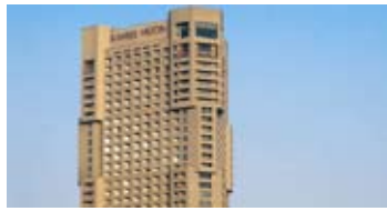
Ramses Hilton | ★★★★★

Ramses Hilton is situated in the Heart of Cairo near the Egyptian Museum. The hotel offers 3 restaurants along with 2 coffee shops/café's, a poolside bar, and a lounge bar. The 771 air-conditioned guestrooms include laptop-compatible safes and minibars.