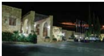
The Old Village Hotel & Resort | ★★★★★

The Leonardo Plaza Hotel Tiberias offers an amazing location in the heart of Tiberias, facing the promenade and overlooking the famous Sea of Galilee and nearby to the Tiberias shopping center. The hotel provides 258 comfortable rooms with balcony.