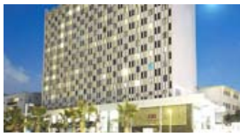
Grand Beach Tel Aviv Hotel | ★★★★★

This hotel is only 5 minutes from the Great Pyramids of Giza and a short distance from the center of Cairo providing contemporary rooms and accommodations. The rooms are fully air-conditioned and feature modern art prints. The stylish bathrooms include a shower and modern amenities.