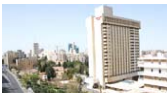
Leonardo Plaza Hotel Jerusalem | ★★★★★

The indoor rooftop pool of Regency Palace offers a panoramic view of Amman. The hotel is ideally located near the city center. Guests can enjoy the rich buffets at Al Madafa restaurant with Jordanian Cuisine, and Polynesian cuisine at Trader Vic's Restaurant, and at the bar you will find Cuban music and fine wines.