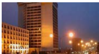
Regency Palace Amman Hotel | ★★★★★

Daniel Dead Sea Hotel is a luxurious 5 star property conveniently located only 6.2 mi from the centre of Dead Sea. The hotel boasts 302 fully equipped bedrooms. Enjoy a meal at one of the hotel's 3 dining establishments plus a café. From your room, you can also access 24-hour room service.