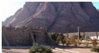
Wadi El Raha | ★★★★★

Located in a prime location in the heart of Tel Aviv, the Grand Beach Hotel offers 212 spacious rooms with a stylish urban design. Enjoy the warm beaches of Tel Aviv, only a few minutes away from the exciting Carmel Market, prestige restaurants and cafes, leading clubs and bars, shopping and cultural centers.