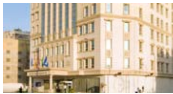
Barceló Cairo Pyramids | ★★★★★

This hotel is only 5 minutes from the Great Pyramids of Giza and a short distance from the center of Cairo providing contemporary rooms and accommodations. The rooms are fully air-conditioned and feature modern art prints. The stylish bathrooms include a shower and modern amenities.