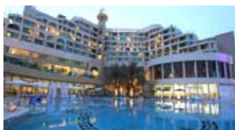
Daniel Dead Sea Hotel | ★★★★★