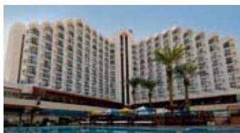
Leonardo Club Hotel Tiberias | ★★★★★

St. Catherine Village, Wadi El Raha is located in South Sinai and offers spacious chalets with a terrace. It boasts a restaurant with a 24-hour room service. The property features beautiful views of St. Catherine Monastery. All accommodation at St. Catherine Village, Wadi El Raha are air-conditioned and simply furnished.