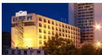
Grand Palace Amman | ★★★★★

Daniel Dead Sea Hotel is a luxurious 5 star property conveniently located only 6.2 mi from the centre of Dead Sea. The hotel boasts 302 fully equipped bedrooms. Enjoy a meal at one of the hotel's 3 dining establishments plus a café. From your room, you can also access 24-hour room service.