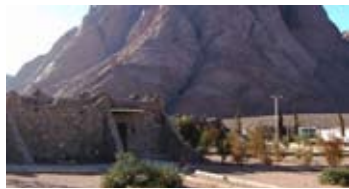
Wadi El Raha | ★★★★★

The Renaissance Tel Aviv Hotels offers 338 rooms and has a privileged location directly on the beach of the Mediterranean Sea and within easy access to dining, shopping, and entertainment. The extraordinary service & attention to detail will make your holy land trip a wonderful experience.