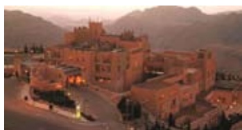
Mövenpick Nabatean Castle Hotel | ★★★★★

The Leonardo Club Hotel Tiberias is the perfect starting point to discover the attractive city of Tiberias, the Golan Heights, or to enjoy a stroll along the beautiful beaches. The hotel provides 398 elegant rooms with private balcony and outstanding facilities.