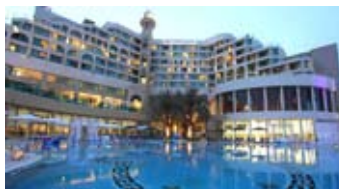
Daniel Dead Sea Hotel | ★★★★★

The hotel is within 1.2 m. from Petra. Guests can enjoy a continental breakfast with 5-star accommodation, plus an indoor pool. 24-hour assistance is available at the reception. All rooms have Wi-Fi access, tea and coffee making facilities, television, air conditioning, safe deposit box and a mini bar. The bathrooms are well equipped with bath/shower, hair dryer and complimentary toiletries.