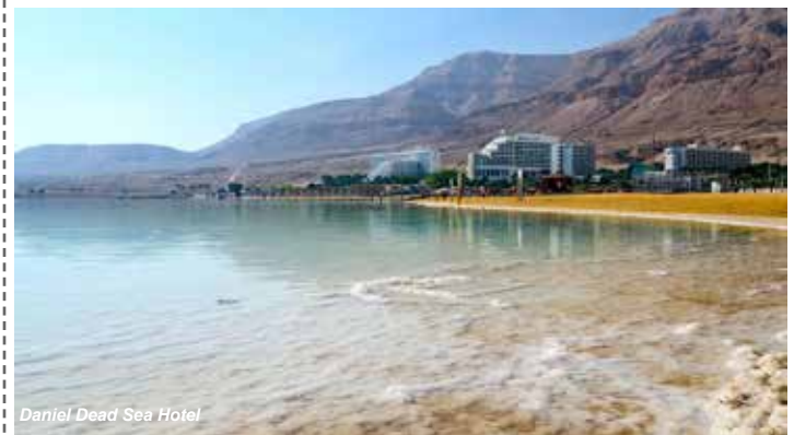
Daniel Dead Sea Hotel

Daniel Dead Sea Hotel is a luxurious 5 star property conveniently located only 6.2 mi from the centre of Dead Sea. The hotel boasts 302 fully equipped bedrooms. Enjoy a meal at one of the hotel's 3 dining establishments plus a café. From your room, you can also access 24-hour room service.