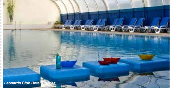
Leonardo Club Hotel Tiberias

Daniel Dead Sea Hotel is a luxurious 5 star property conveniently located only 6.2 mi from the centre of Dead Sea. The hotel boasts 302 fully equipped bedrooms. Enjoy a meal at one of the hotel's 3 dining establishments plus a café. From your room, you can also access 24-hour room service.